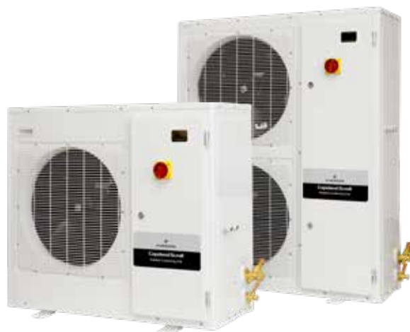
Copeland ZX outdoor refrigeration units with scroll compressors