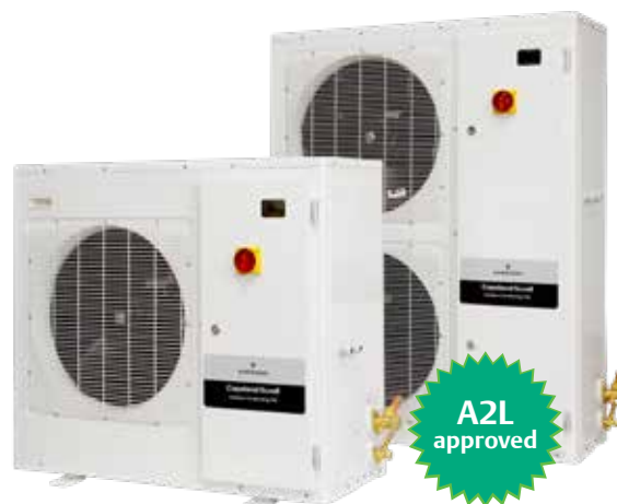
Copeland ZX outdoor refrigeration units for A2L refrigerants